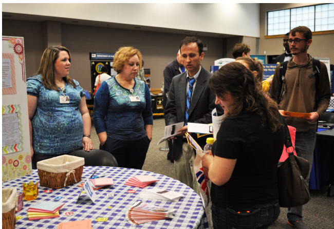
About 400 people visited the BCCC Career Fair during Advanced Manufacturing Awareness Week.

Manufacturing , from Page 5 upgrade their skills.”