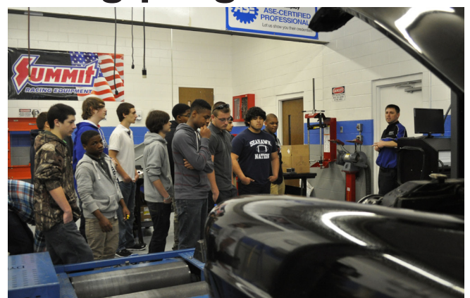
This group of Southside High School students were some of the 800 students who toured BCCC's manufacturing programs during Advanced Manufacturing Awareness Week.