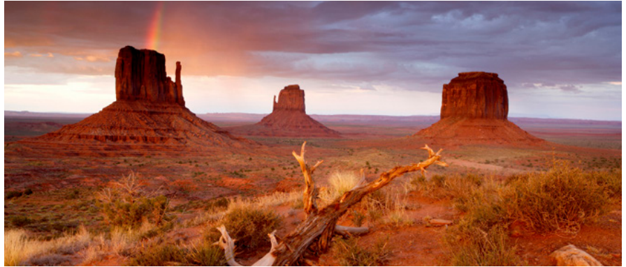
The beautiful Monument Valley is one of the sights awaiting those who travel with the Beaufort County Community College Foundation to the Canyon Country.

The itinerary includes a flight from Raleigh-Durham International Airport to Scottsdale, Ariz., a visit to stunning Sedona, the South Rim of the Grand Canyon, Lake Powell and Zion National Park. The trip will end in Las Vegas where travelers will spend two nights at the famous Paris Hotel.