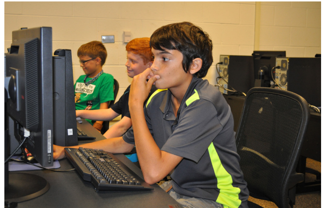
Campers in BCCC's College for Kids 2014 concentrate on developing video games. Two video game camps are planned for this summer's College for Kids.